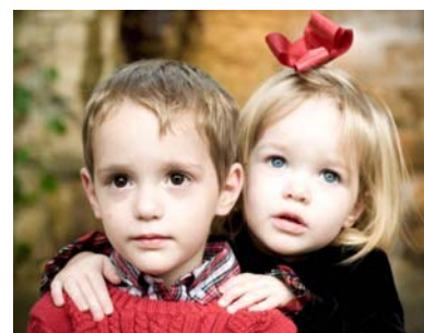
Fun times for our children; they are full of awe at God's beauty in creation.